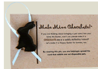
To order go to: www.makeminechocolate.org

So keep an eye out for the ceramic bunny with the blue ribbon. And think twice before you take that cute little bunny home. Pins can be purchased locally for a $5.00 contribution by contacting Pet Allies at 532-1602. For more information on the "Make Mine Chocolate!™" campaign, visit www.makeminechocolate.org .